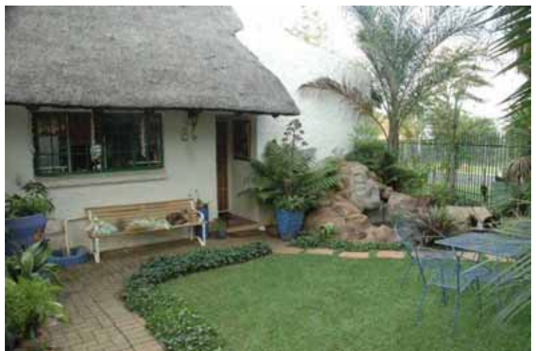
ArtKat Studio, Pretoria

We welcome the Johannesburg students and wish them a long and enjoyable period with ArtKat Studio. They have started on the colour course and are all doing very well.