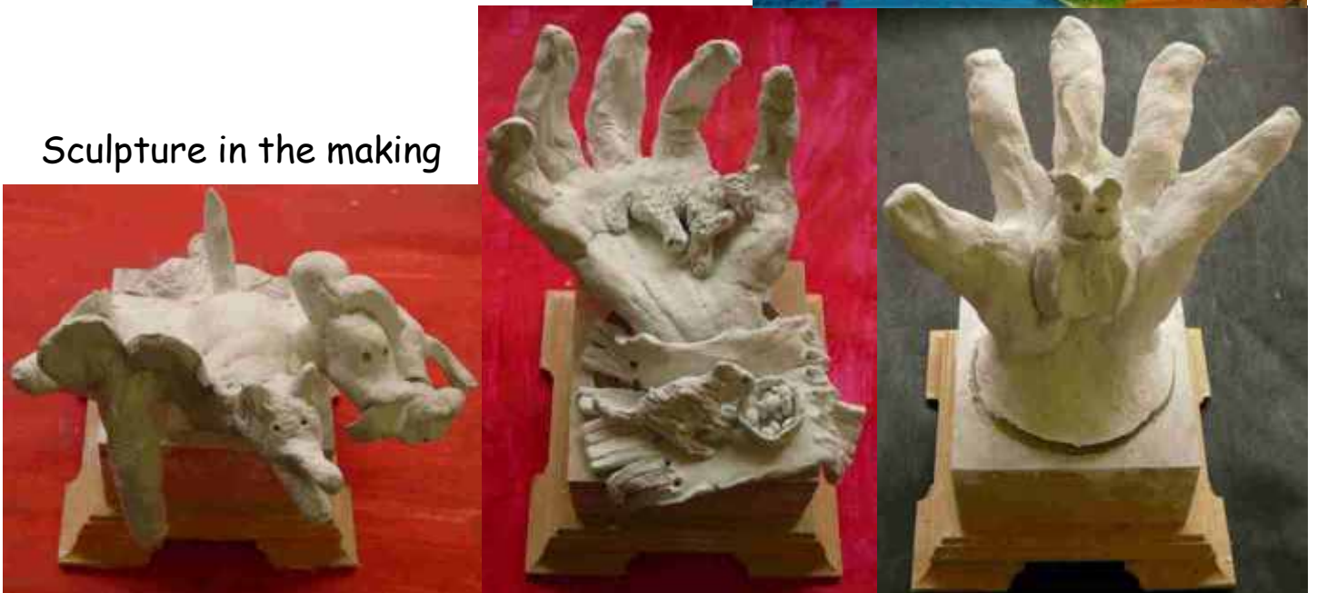
Sculpture in the making