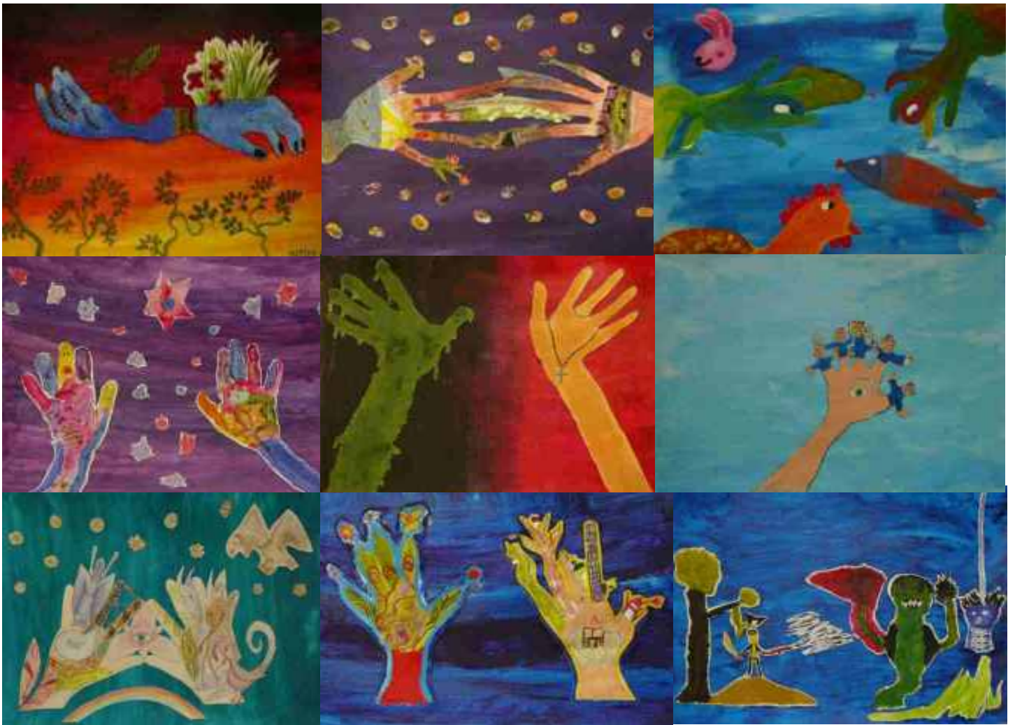
Dream Drawings Pavane sculpture in the making