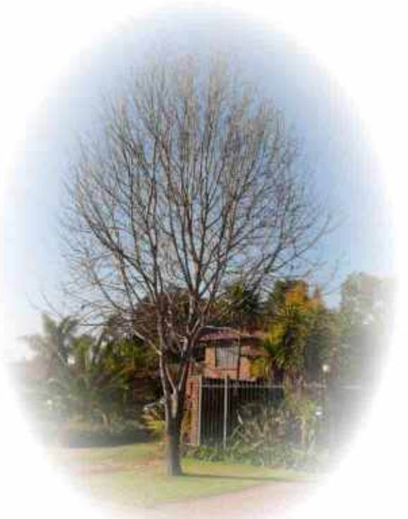
Our Season Tree